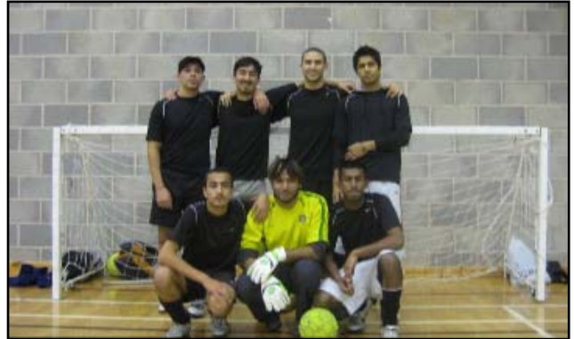
One of ten teams in the Manchester IUS Weekly Football League 07-08

Whatever your passion is and whatever ideas you think can work, the IUS will support you. Projects can have a social and recreational focus, such as sports, dinners and outings. Other projects can be more educational such as study circles, lectures and seminars. Islam aims to provide everything for society and so the IUS aims are in line with that.