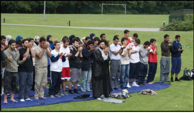
Congregational prayers at the IUS summer camp in July 2009

There is no better work than Islamic work for the community and you will find it to be a thoroughly rewarding experience. In addition, you will be working within a professional atmosphere where you will pick up an array of different useful skills which will no doubt benefit you in your future. There is no specific age limit however committee members are typically university students or young professionals. We currently require people in the following areas: